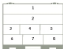
Bin Diagram This edge to hinge →

Additional kits available at www.preactkits.com or contact a TE-Connectivity authorized distributor